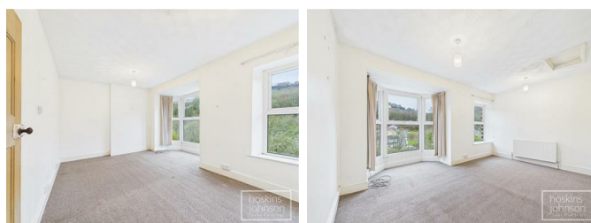
Bedroom 1 15'7" x 10'3" (4.77 x 3.14)