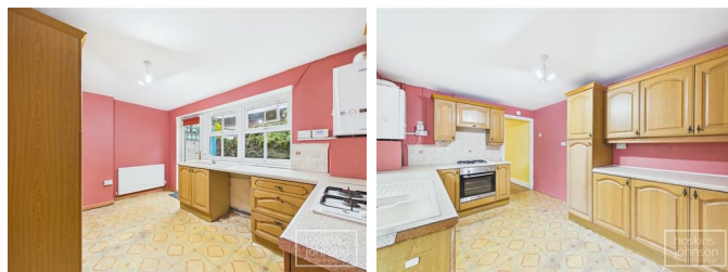
Kitchen 12'11" x 9'4" (3.94 x 2.85)