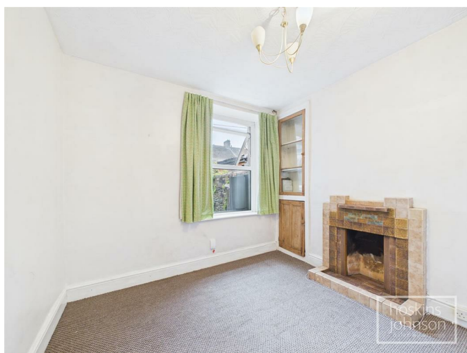
Sitting Room/Home Office 10'1" x 9'11" (3.09 x 3.04)