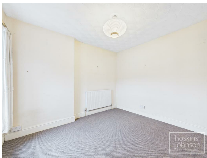
Bedroom 2 11'4" x 10'5" (3.47 x 3.19)